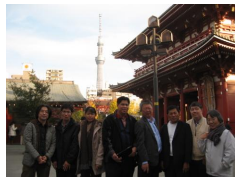
Photo with Sky Tree and five-story stupa in Asakusa