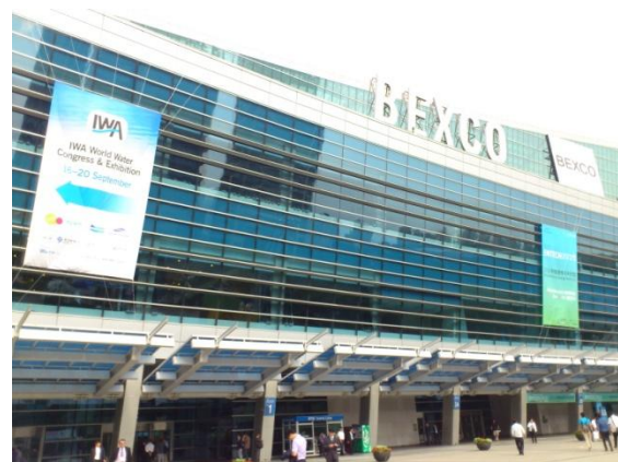
BEXCO that the congress was held

My main purpose was to give a presentation on damage of water supply by the Great East Japan Earthquake and the rehabilitation at Japan pavilion in exhibition hall. Because it was provided in an open space, so many people who walked in exhibition hall stopped to hear my presentation. I was really impressed by the people who seriously