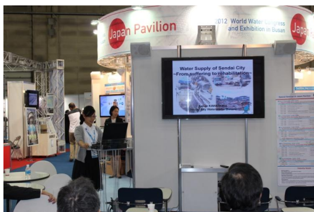
Presentation at Japan Pavilion

listened to the situation of water suspension in Sendai. What I wanted to emphasize in particular was that people's network was so important when a disaster occurred. So I took a lot of time to talk about our mutual cooperation system at emergency works. In addition, I appreciate so many helps and encouragement we received from all over Japan and foreign countries. After my presentation, some people encouraged me and I could make new network. I would like to value this network. And I renewed my resolve to hard work for the construction of disaster-proof water supply system.