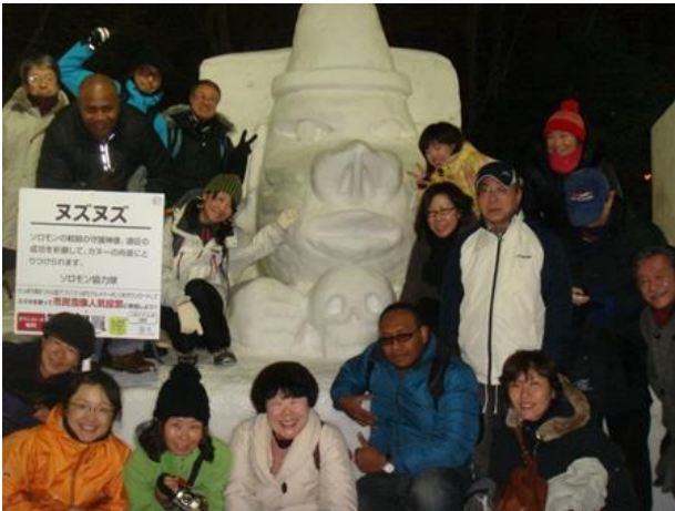
After the completion party, everyone seemed to be satisfied

was finally completed. We all jumped with joy and took many pictures playing the face of “Nguzu-Nguzu”. That night, we hold a party to celebrate the completion. The director of JICA Hokkaido also participated, and it was a big banquet for a total of 20 people. After the completion party, everyone seemed to be satisfied.