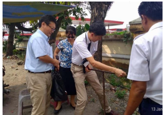
In Medan, Indonesia

After that, I was transferred to YWWB and did not have opportunities to participate in international cooperation for a while. However, when YWWB decided to implement JICA Partnership Program, to support the Water Corporation of Medan, Indonesia, I visited the site twice in 2019 for preliminary survey. The objective of the program was to improve its capacities for water purification and distribution. However, due to the outbreak and spread of the COVID 19 immediately after the field survey, activities of the project are still not yet be implemented, although we keep in touch with the Indonesian side. At present, I am dedicated to the LisCaP, however, I hope the project for Indonesia will also be active soon.