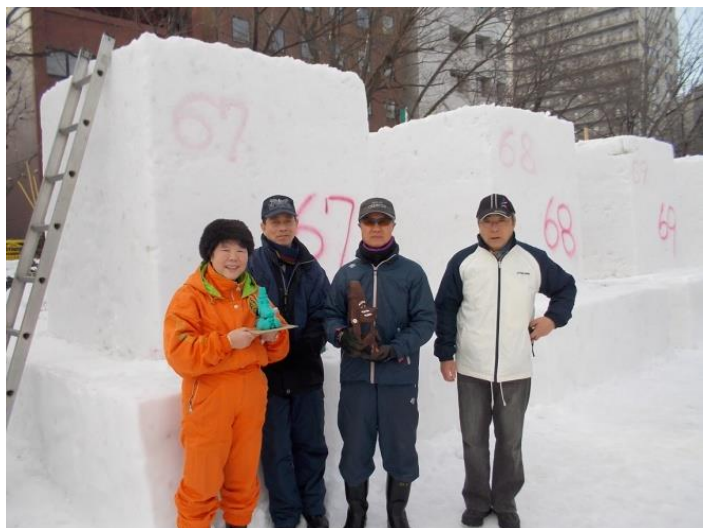
Start making snow statues with only oldsters!

cutting can be done on the first day. In some years when it rains it’s easy to cut, and in other years when it’s frozen it’s too hard. Most Solomon returnees planned to appear after the third day. Participants from the first day were only local oldsters. I was wondering what would happen, but soon after, a rough shape appeared by the wonderful cooperative play, one carved the snow, the others carried it with a snow scoop. I understood it was because they were usually trained to remove snow around their houses.