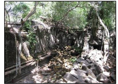
Photo: Collapsing ruins

by growth of banyan trees. They would have been collapsed in the certain future. It was precious experience to me.