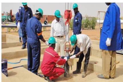
Training course on "Management of wells"

"Project on Human Resources Development for Water Supply" was started in June 2008, as the first project of resuming Japanese ODA in the northern Sudan. The project aims to strengthen function of the training center, which was set up by National Water Company (PWC), Sudan. The training center, constructed by Sudan side, had never conducted any training course, and was requested to start training soon by the State Water Companies (SWC) in the northern 15 states, because there was no opportunity for water supply sector to receive training in the country. We came here to support staff of the training center for