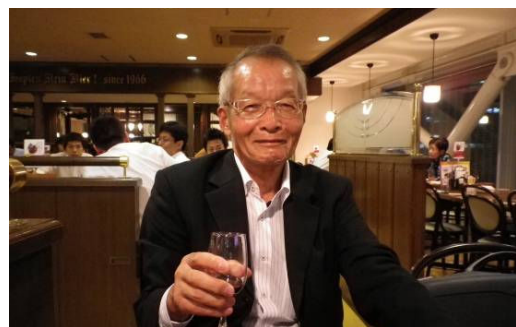
21st July, at the beer garden near Osaka station