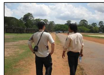
Talking with the guide "It's hot today."

I got experience to find the Japanese was rather unlike other nationals in terms of toilet or foods. I saw and felt a lot in Cambodia, which was good experience, and may be helpful for me to participate in activities of WaQuAC-Net with more tough