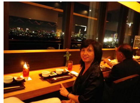
At a restaurant in Takashimaya 14th floor, Times Square, Shinjuku South