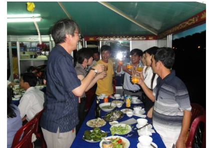
Dinner with counterparts of HueWACO and the training center

We have started surveys of water supply utilities in the central region to design proper training program responding to their current situations. Vietnam has long land from north to south, then the