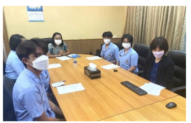
Zoom meeting with dean and students